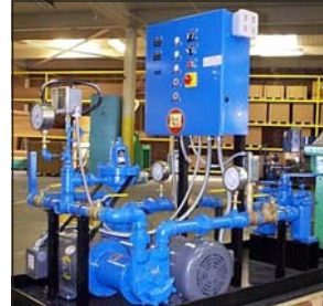
Fuel Oil Handling Systems