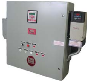
Burner Control Upgrade Packages